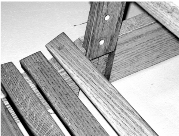
Close-up of seat and back lap joint fitment figure 2b

STEP 2: Assemble the back and seat. Align the seat and back (as shown in figure 2a, and 2b), fitting the lap joints together. Insert one carriage bolt in each end to temporarily hold the seat and back together. Tighten the nuts finger tight. Insert the remaining carriage bolts through the lap joint and tighten the nuts finger tight.